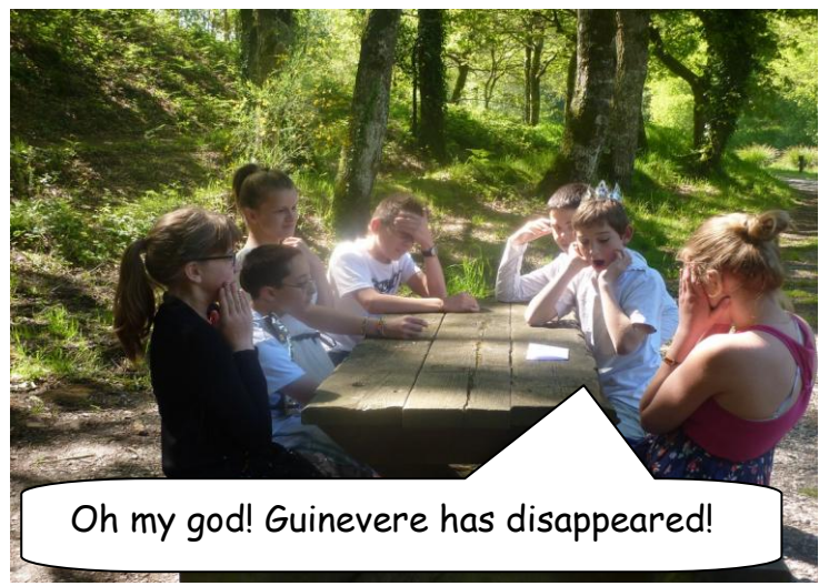
They realised Guinevere had disappeared.