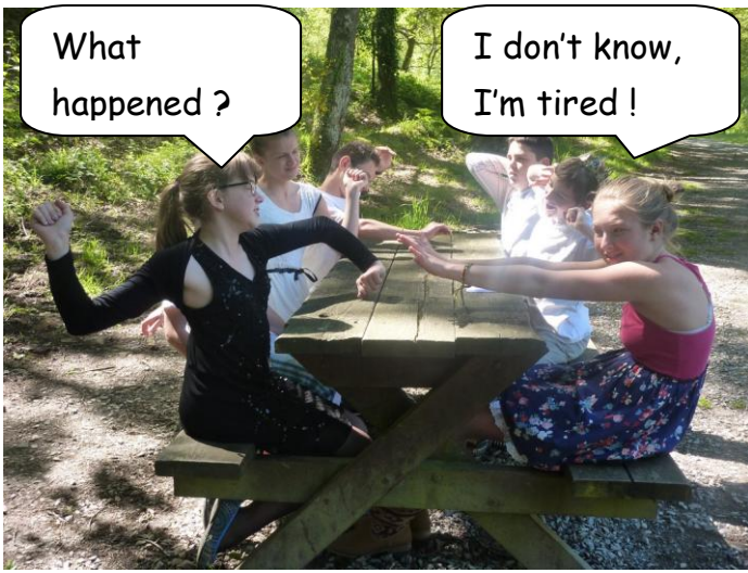
The court woke up.