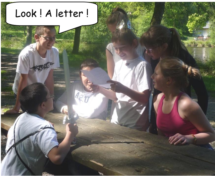
The strange merchant left a letter, Arthur read it.