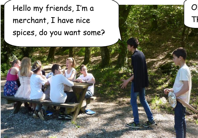
Arthur and his court were banqueting, everyone was happy !

Hello my friends, I'm a merchant, I have nice spices, do you want some?